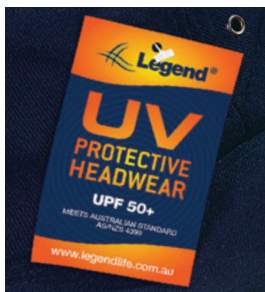
UV Protection info label