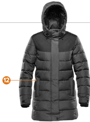
Heather Grey (W's)