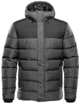
Heather Grey (M's)